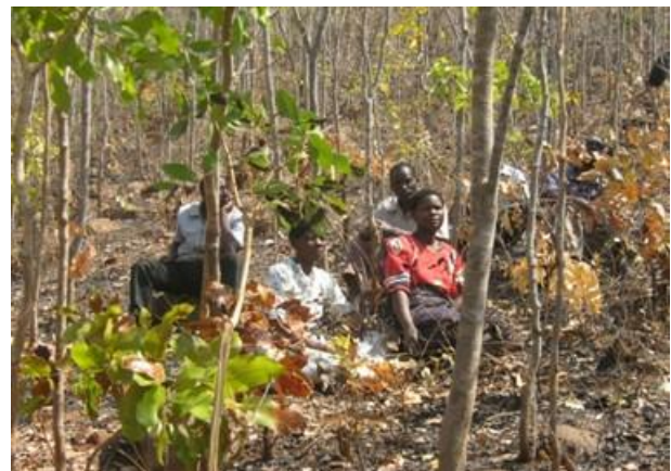
Sendwe community members in their village forest area