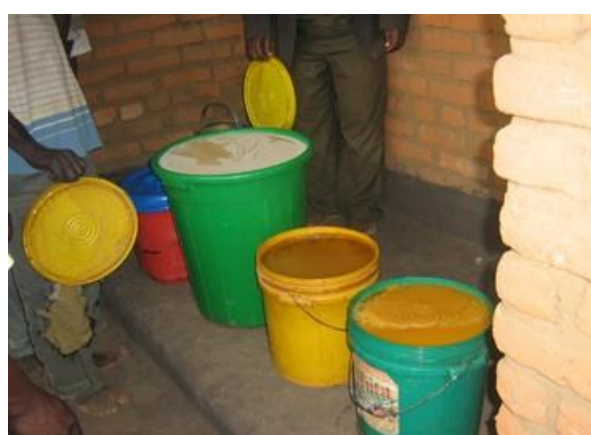
Honey production in Sendwe village